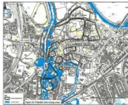
Northwich Area Flood Risk Assessment